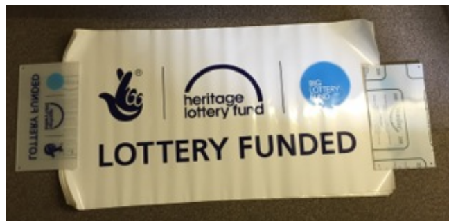
Sign 1: Rectory Lane Entrance